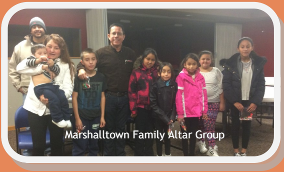
Marshalltown Family Altar Group